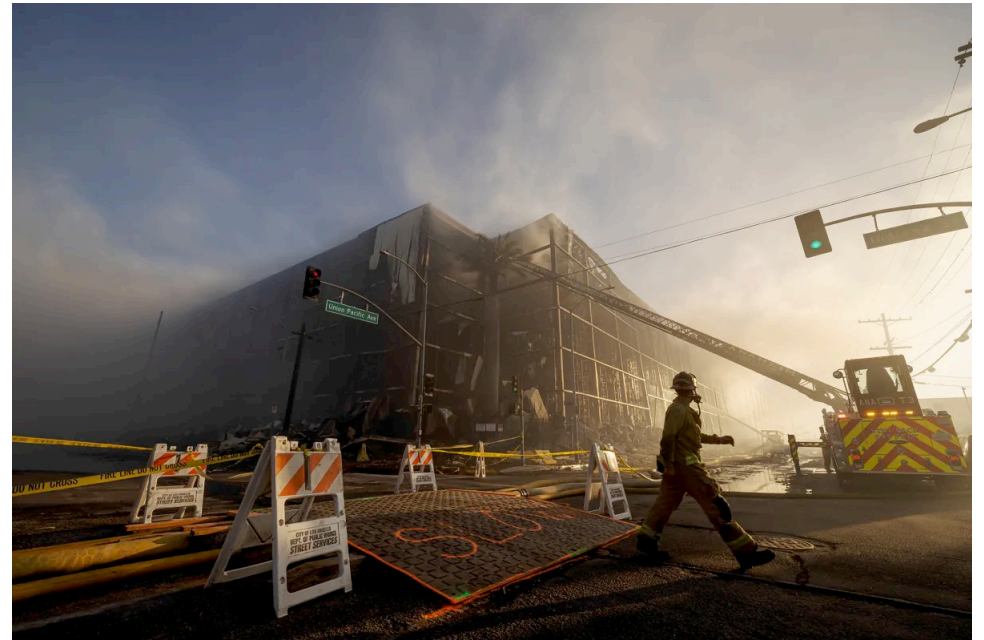
Firefighters battle a blaze at a cold storage facility in the Boyle Heights neighborhood of Los Angeles on June 22, 2026. Authorities declared a state of emergency as the fire intensified, prompting evacuations in the surrounding area. The fire started on June 17, 2026.